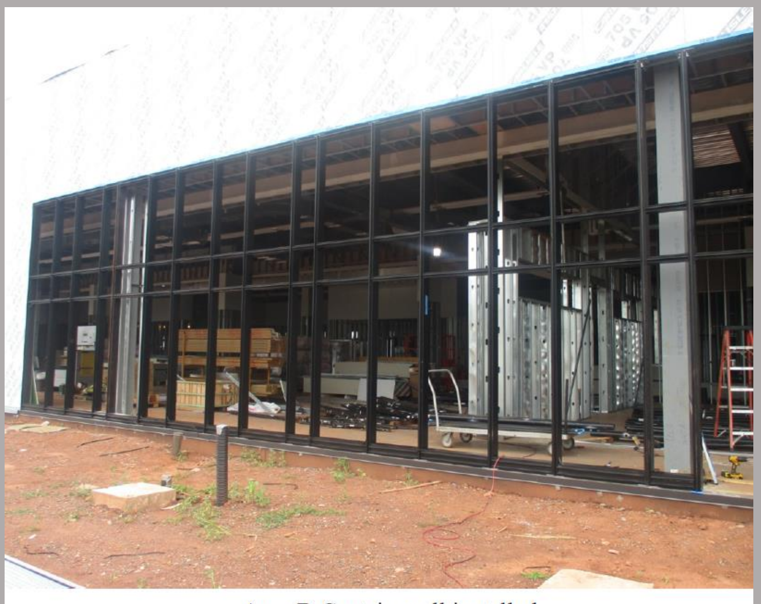
Area B Curtain wall installed