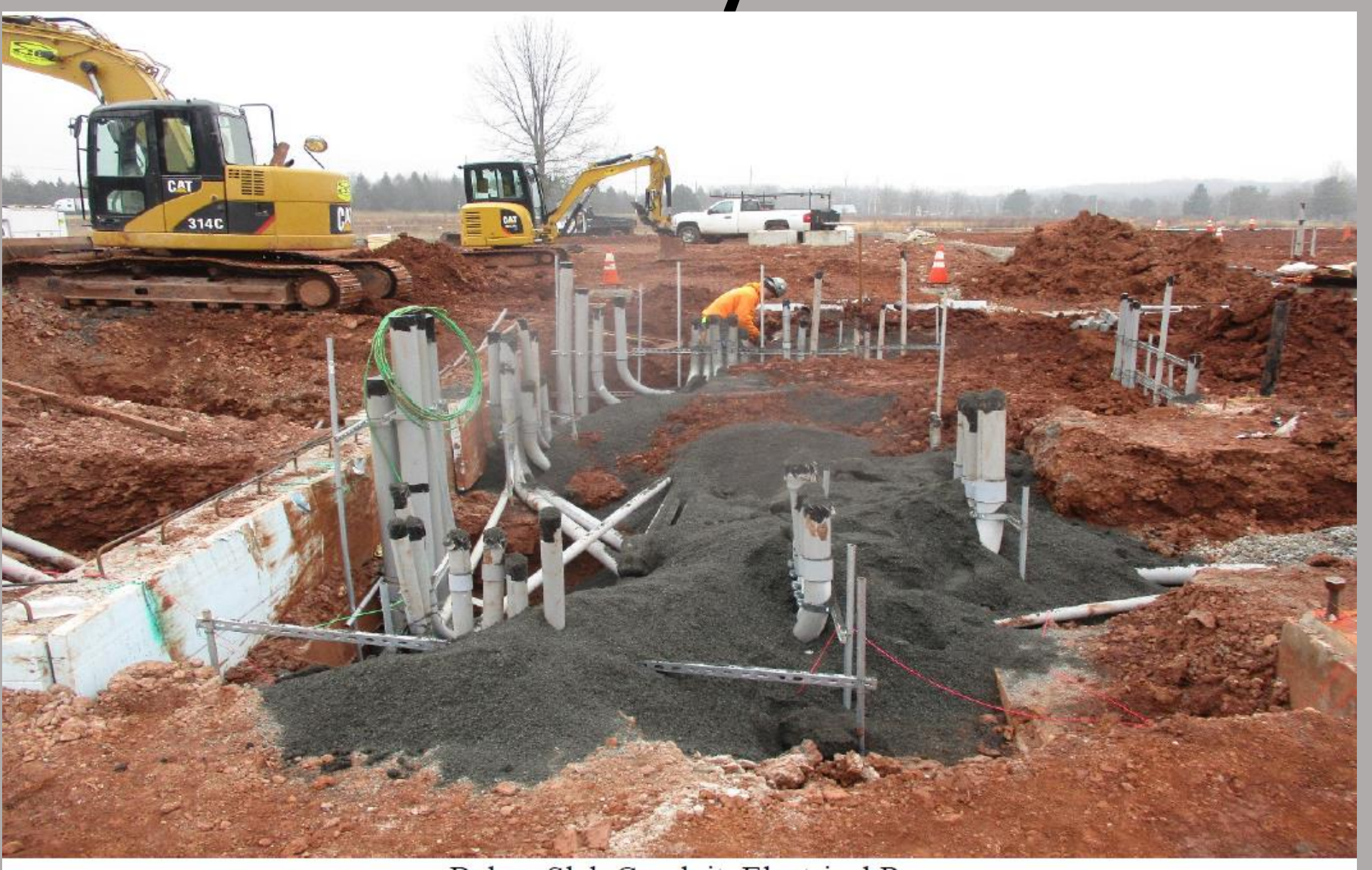
Below Slab Conduit, Electrical Room