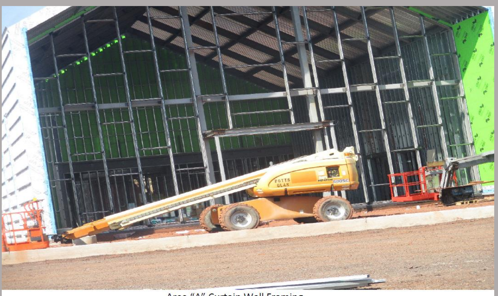
Area "A" Curtain Wall Framing