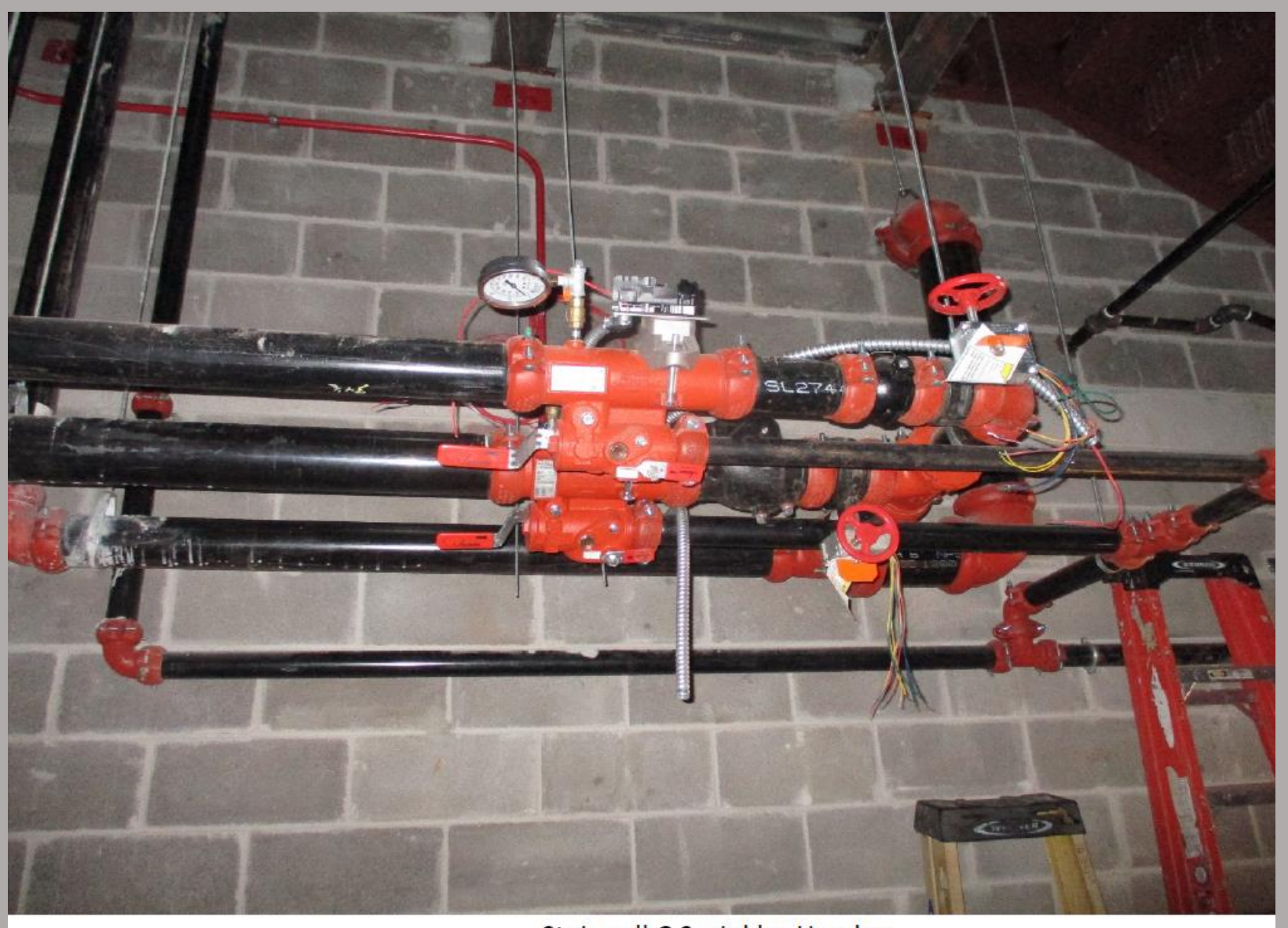
Stairwell C Sprinkler Header