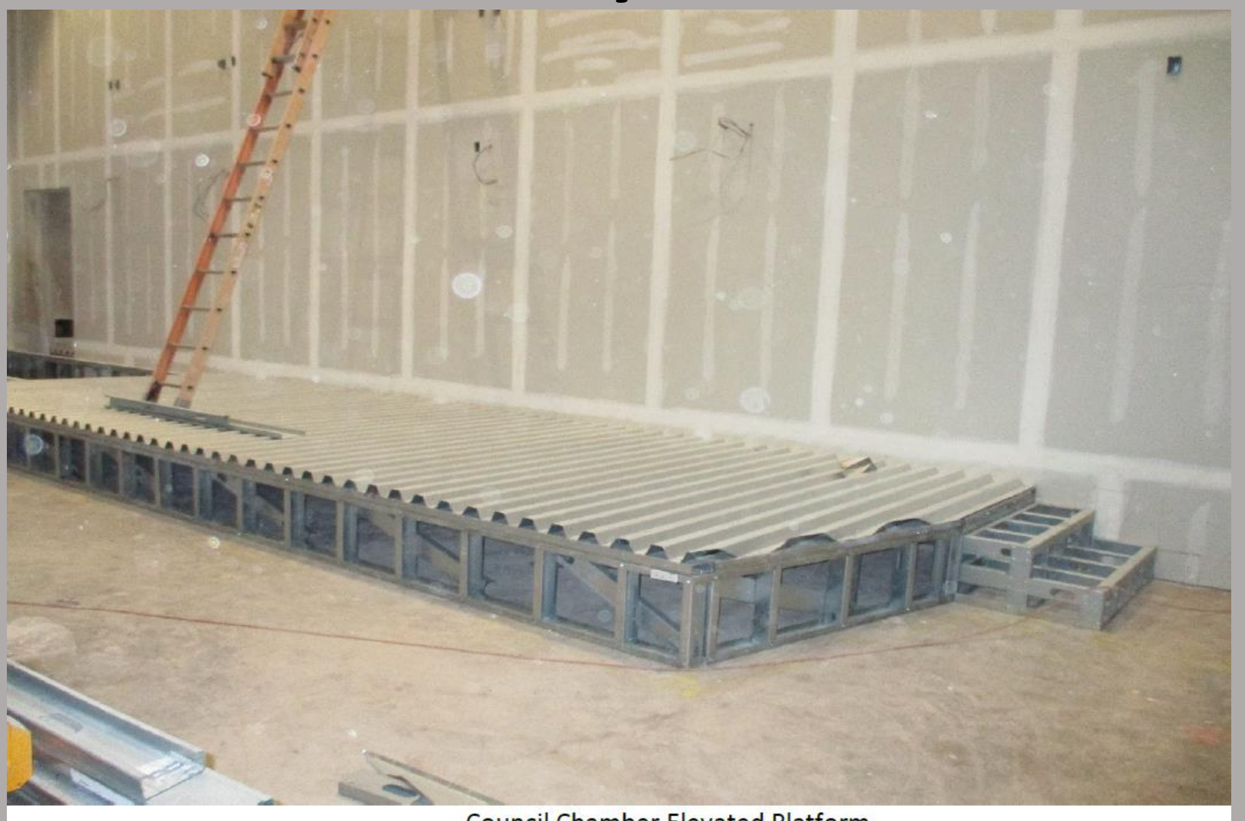
Council Chamber Elevated Platform