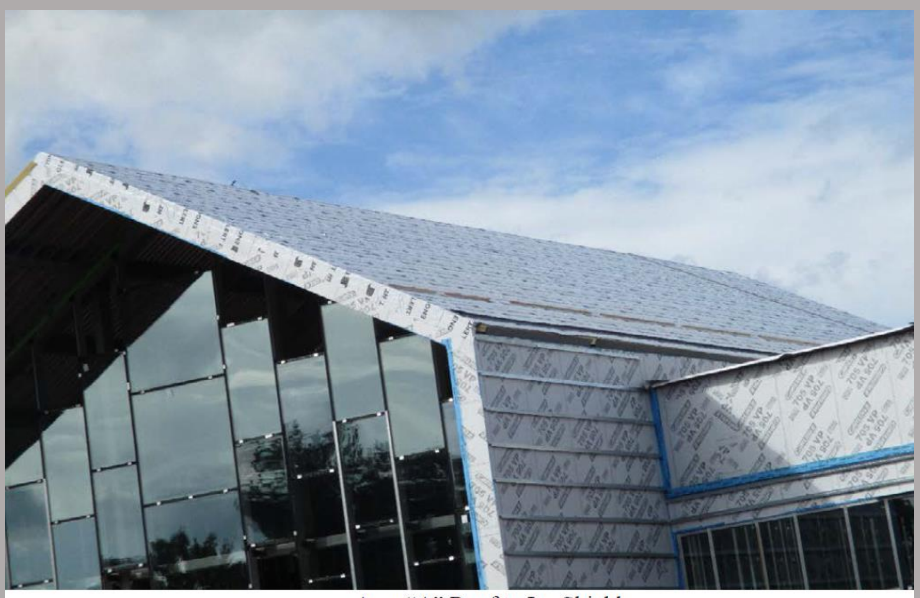
Area "A" Roof to Ice Shield