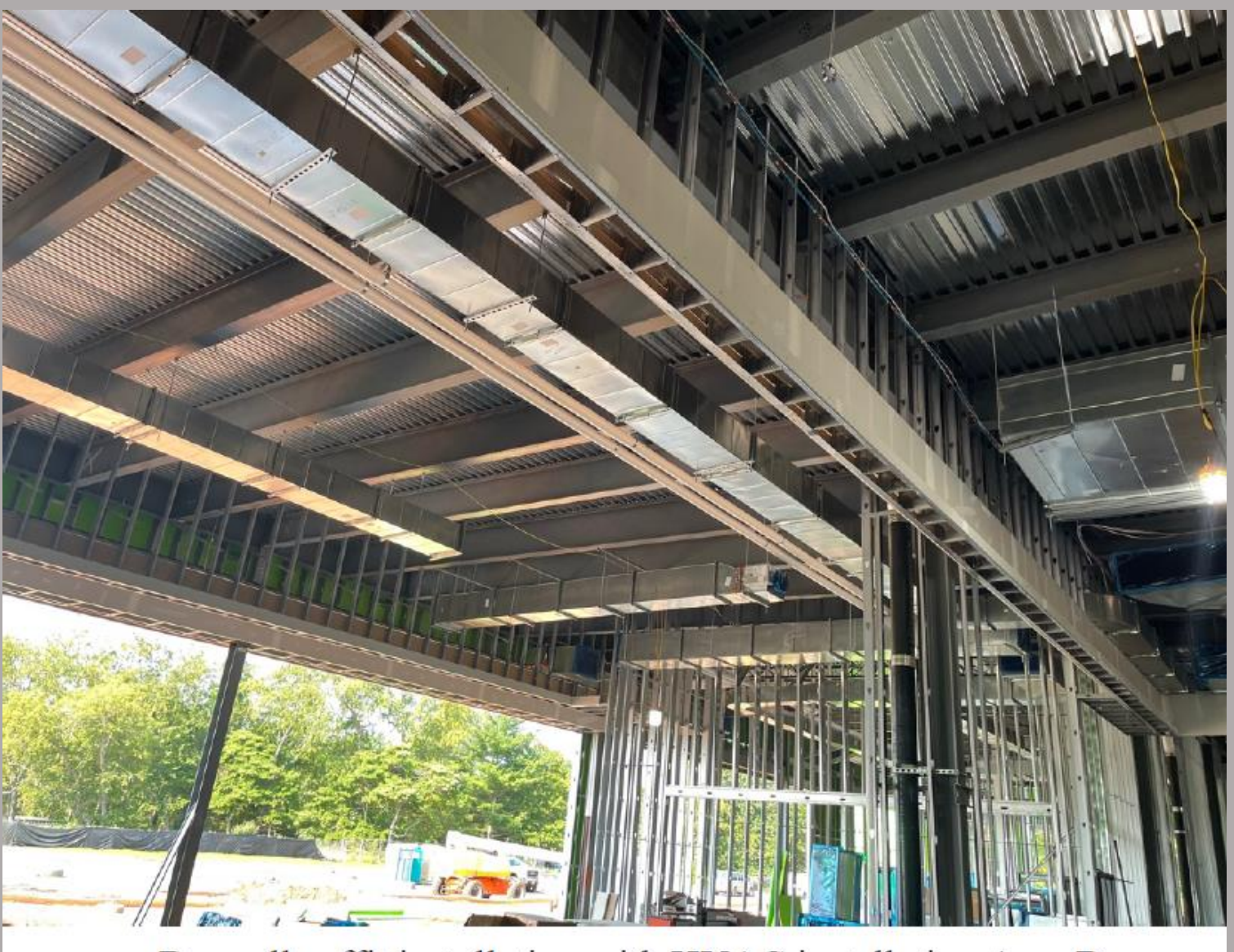
Drywall soffit installation with HVAC installation Area B