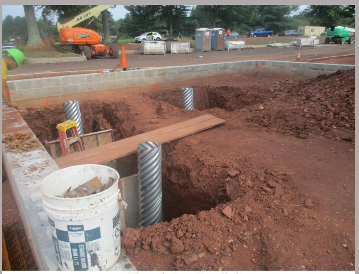
Flagpole Base Installed