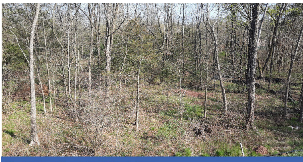
Typical Vegetation in the Uplands Areas

vegetated with various successional species of shrubs and trees, indicating previous disturbance of the upland areas. Fox Brook runs along the southeast boundary of the property, with associated wetlands located within the property's wooded landscape.