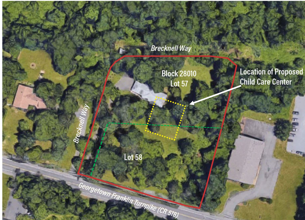
Aerial of Malvern School Property