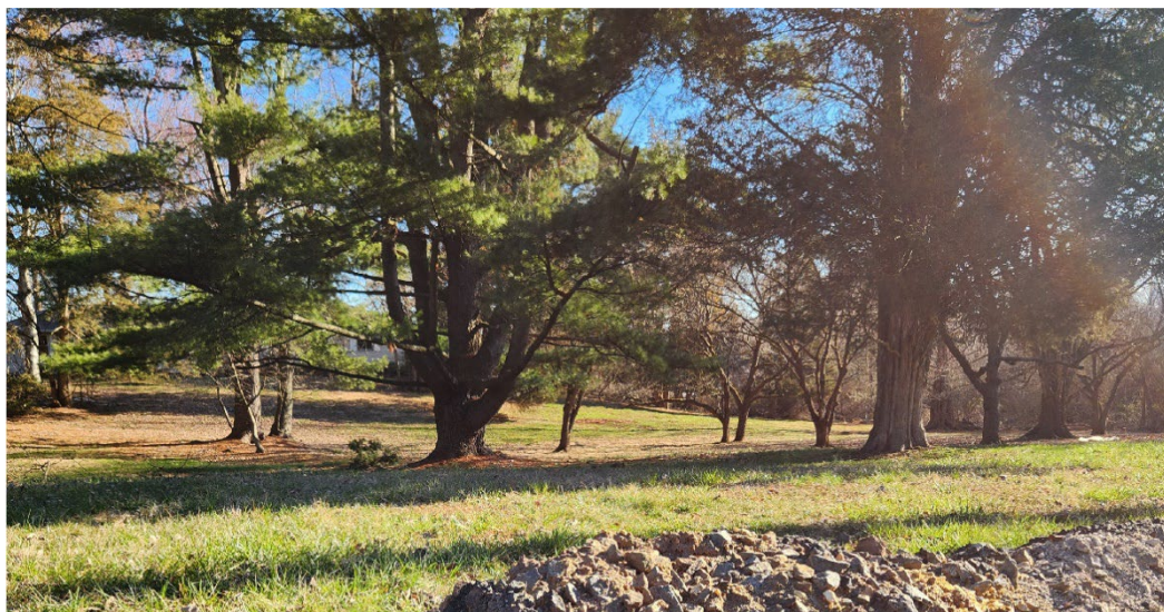
View of Site from Route 518